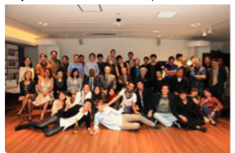
Image 025: Students, faculty, and jurors celebrate at the awards ceremony.