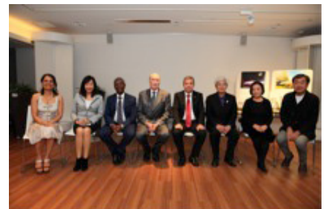
Image 021: Jurors for the Dhillon Marty Hojoki: Mobile Pavilion competition.